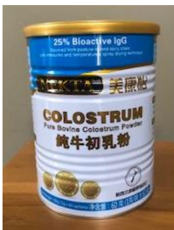
NEKTA Colostrum Powder

NEKTA Pure Bovine Colostrum Powder is easy to use. Just simply add a sachet (1g) of colostrum powder into 30 - 50 ml water (below 50°C), milk, porridge or include as part of meal preparation.