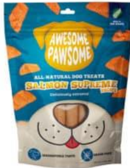
Salmon Supreme Recipe

Awesome Pawsome promises healthy and delicious snacks for dogs, made from all natural colours and flavours inspired by human recipes, letting your pets enjoy the food you love. Discover a whole new range of awesome treats specially formulated for your awesome pets. There are Fancy Treats, Meaty Treats and Veggie Treats.