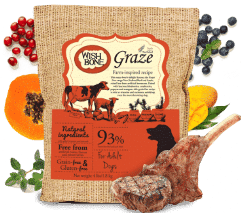
Graze – Grain Free New Zealand Beef, Adult