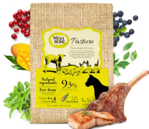
Pasture – Grain Free New Zealand Lamb, All Life Stages