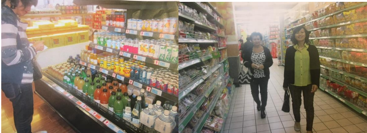
Nekta Kiwifruit Juices sold at Supermarkets, Hangzhou, China