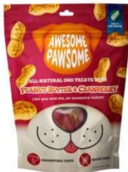
Peanut Butter & Cranberry