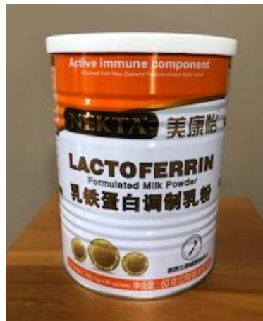
NEKTA Lactoferrin Milk Powder