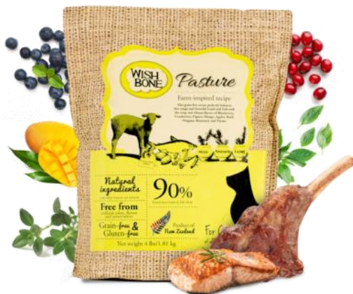
Pasture – Free-range, Grass-fed NZ Lamb, All Life Stages