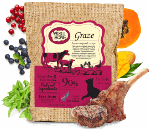
Graze – Free-range, Grass-fed NZ Beef, All Life Stages