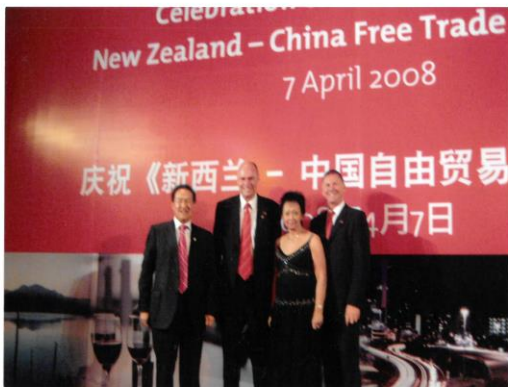
NEW ZEALAND – CHINA FREE TRADE AGREEMENT SIGNING BEIJING, APRIL 2008