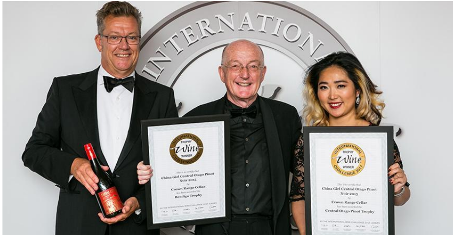
Photo: NZ owner accepts International Wine Challenge Trophy Awards 2017 at The Guild Hall, London.

ethereal. Better with a little bottle age.