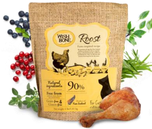
Roost – Cage-free NZ Chicken, All Life Stages