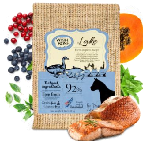
Lake – Grain Free New Zealand Duck, All Life Stages