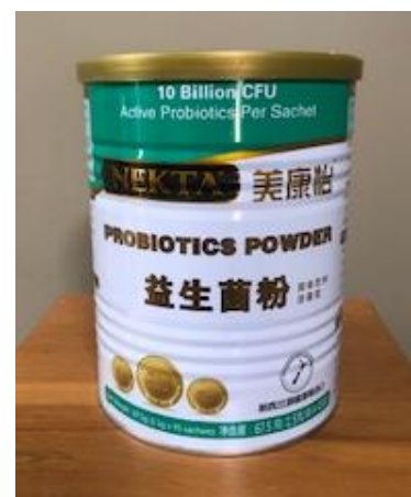
NEKTA Probiotics Powder