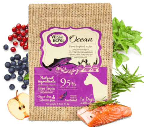
Ocean – Grain Free King Salmon, All Life Stages