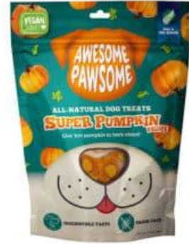
Super Pumpkin Recipe